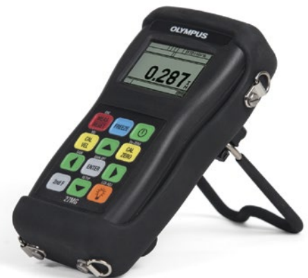
27MG with the optional Protective Rubber Boot with Neck Strap and Gage Stand

Standard inclusions may vary depending on your location. Contact your local distributor.